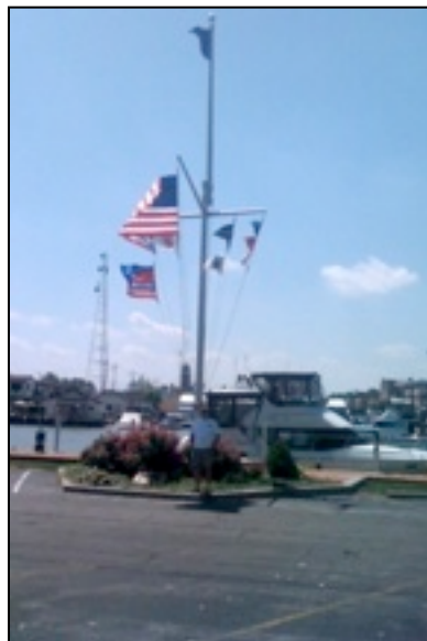
Port Clinton Yacht Club